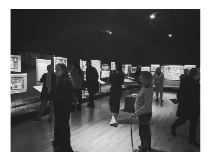
Workshop participants in Gallery 3