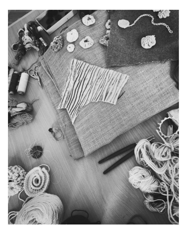
Display of workshop materials