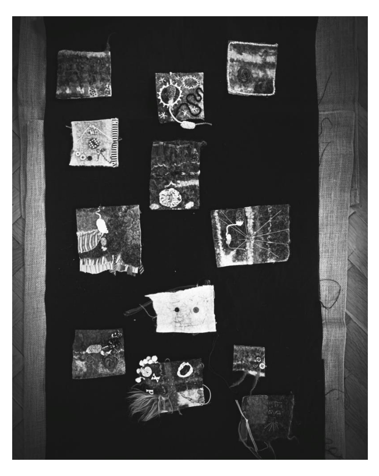
Each participant placed the sewn piece onto a temporary cloth backing and shares thought and feelings expressed through the workshop