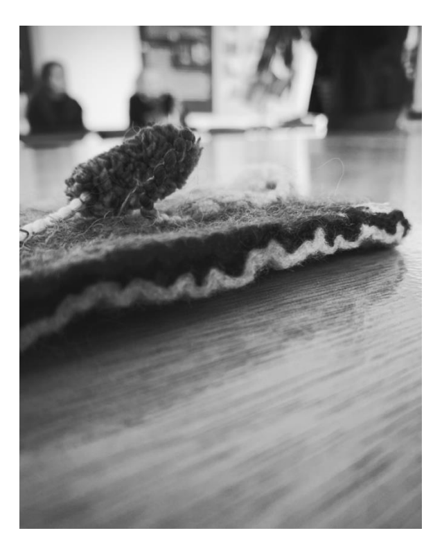
Side view that shows richness of the felt